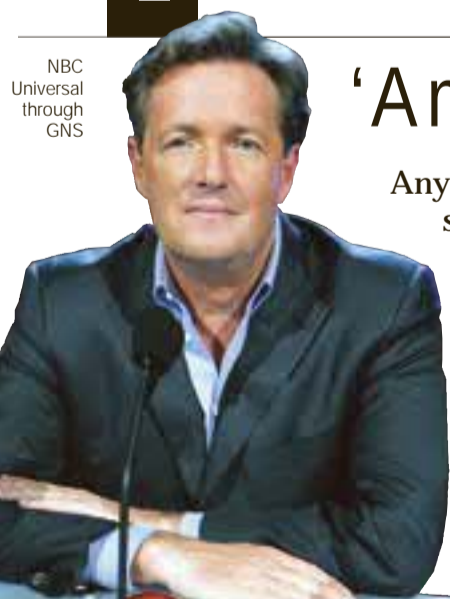
NBC Universal through GNS